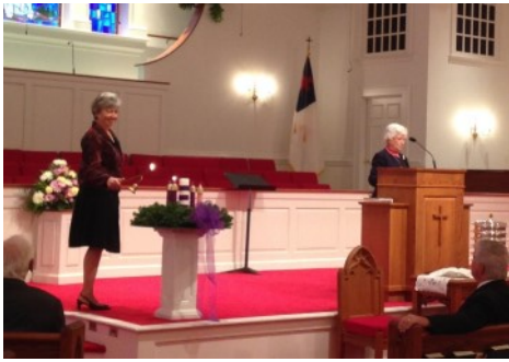
The Morning Friendship Circle plans and organizes the Advent Candle lighting each Christmas season.

By far, the Circle's largest event is held annually on the third Monday of April - The Ladies' Salad Banquet. Invitations are extended to other nearby churches, including all of our sister Christian Churches and Churches of Christ. The evening consists of a delicious array of salads brought by the participants. Did you know that chocolate cake can be considered a salad? It can if it's on the table at the Salad Banquet! After eating, the ladies enjoy an inspirational message from a guest speaker, worship through music, and take up a collection for a charity of the speaker's choosing. It's a wonderful evening that ladies from all over the area look forward to each year.