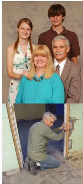
Guy installing a door frame at MMS in 2014.